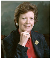
Mary Robinson (Mary Robinson Foundation - Climate Justice, Ireland)

The first female president of Ireland (1990-1997), Mary Robinson became the United Nations Special Envoy on Climate Change in 2014, and is president of the Mary Robinson Foundation - Climate Change. A former United Nations High Commissioner for Human Rights, Mary founded and was president of Realizing Rights: The Ethical Globalization Initiative. She was educated at the University of Dublin (Trinity College), King's Inns Dublin and Harvard Law School, and as an academic (Trinity College Law Faculty 1968-90), legislator (Member of the Irish Senate 1969-89) and barrister (Irish Bar 1967-90, Senior Counsel 1980; called to the English Bar 1973) has sought to use law as an instrument for social change, arguing landmark cases before the European Court of Human Rights and the European Court in Luxembourg. The recipient of numerous honors and awards throughout the world including the Presidential Medal of Freedom from President Obama, Mary is a member of the Elders, former chair of the Council of Women World Leaders and a member of the Club of Madrid.