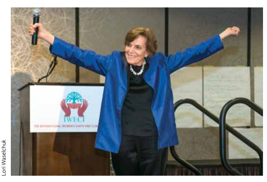
WECAN International Women's Earth and Climate Summit