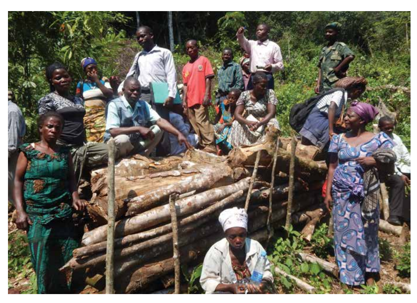
WECAN and SAFECO DR Congo Climate Training 2014