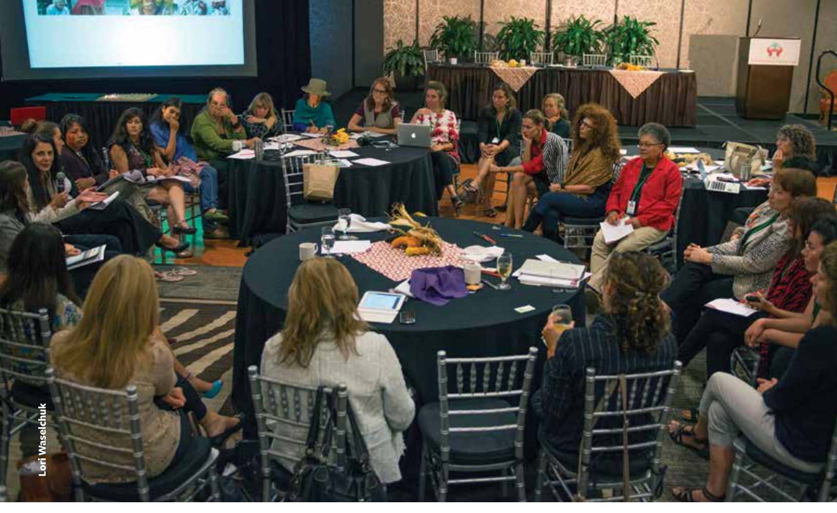
WECAN International Women's Earth and Climate Summit