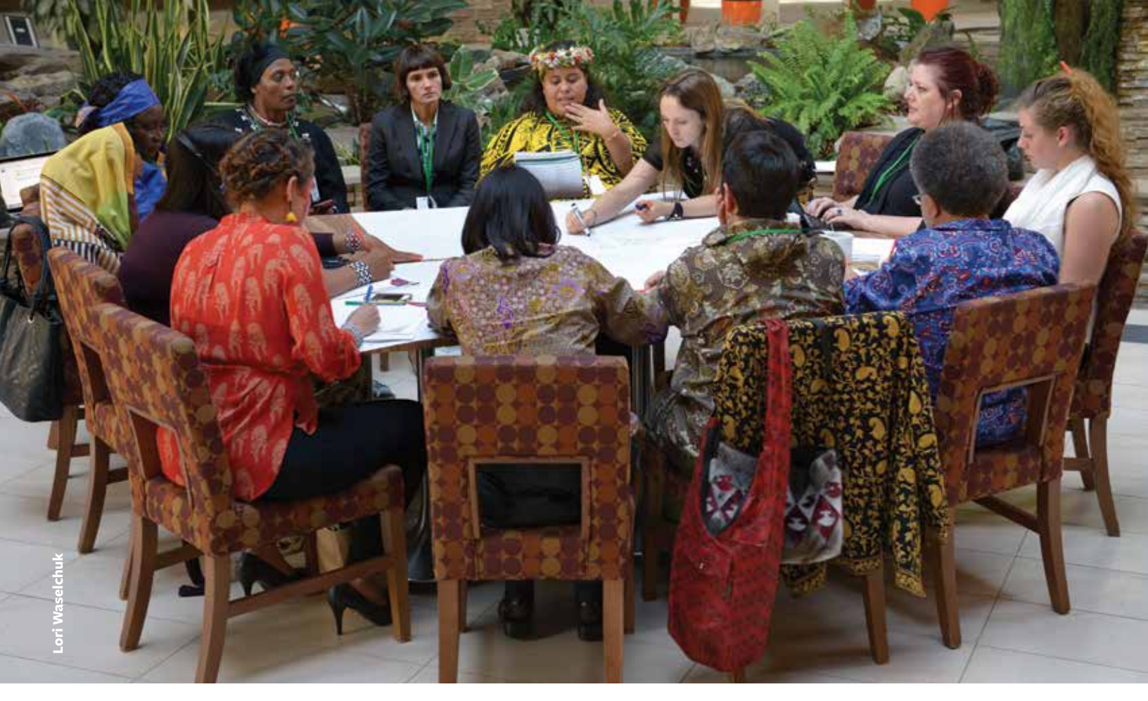
WECAN International Women's Earth and Climate Summit