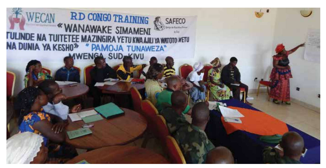
WECAN and SAFECO DR Congo Climate Training 2014