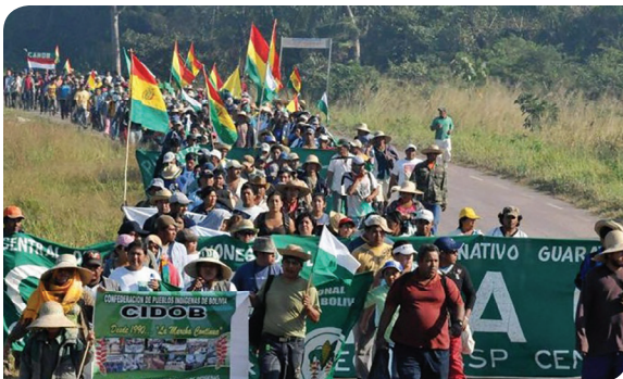
Bolivia: Indigenous peoples mobilize against highway through the rainforest

On August 15th, 2011, around one thousand Indigenous people of the lowlands of Bolivia started in the city of Trinidad the “Eight March of Indigenous people” in defense of TIPNIS. The march was dismissed by the government from the beginning. When it arrived the 25th of September to the locality of Chaparina five hundred policemen intervened violently and dissolved the march detaining hundreds of people.