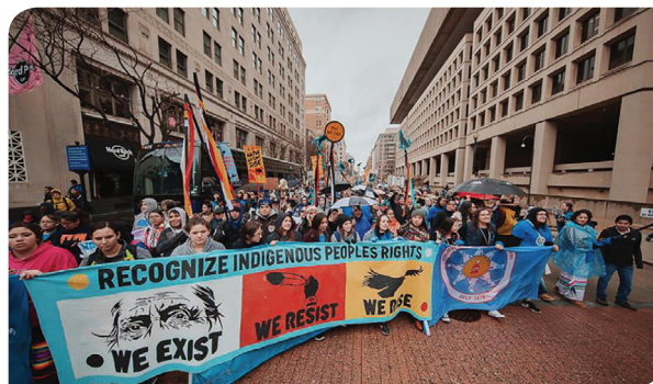
Native Nations Rise March

Our first environment is water. We live in water throughout gestation inside our mother who then gives birth through water - Mni Wiconi