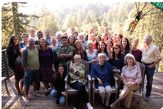
Participants at the Stillheart Institute

In October 2013, on Ohlone Indigenous land, Global Exchange and partners held a 3-day summit at the Stillheart Institute in Woodside, California. Nestled in the California Redwood forest a counsel of 32 global social movement leaders including Indigenous leaders, deep ecologists, grassroots justice advocates, economists, climate experts, localization activists, globalization thinkers, writers and researchers were convened to examine the emerging legal framework known as Rights of Nature, or Rights of Mother Earth. This declaration emerged and is affirmed by the undersigned participants.