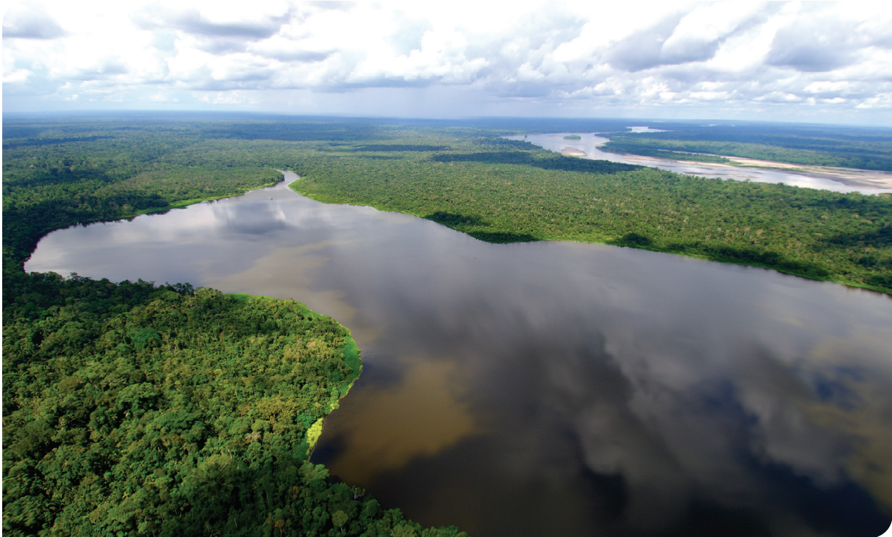
Orellana Province, Ecuador

“The message our Living Forest proposal delivers is aimed at the entire world with the goal of reaching the hearts and minds of human beings everywhere, encouraging us all to reflect on the close relation between Human Rights and the Rights of Nature.” From Kawsak Sacha, The Living Forest: An Indigenous Proposal for Confronting Climate Change, presented by the Amazonian Kichwa People of Sarayaku, Ecuador