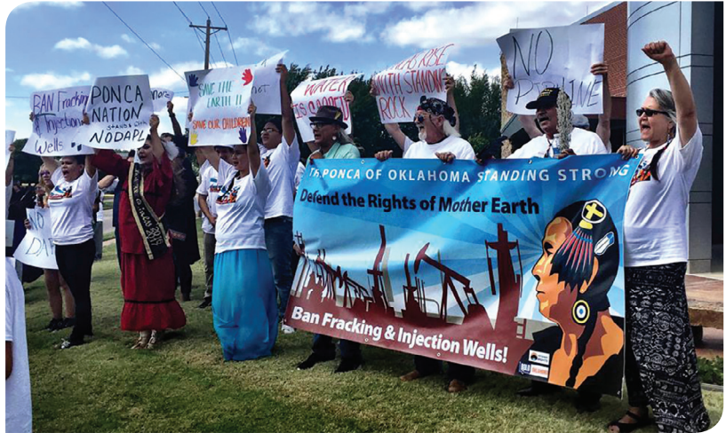
The Ponca Tribe of Oklahoma will pass rights of nature into tribal law by December 2017.