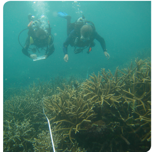
Scientists study the deterioration of the Great Barrier Reef

However that perspective overlooks the fact that judgements such as this provide an example of what kind of judgement is possible and thereby expose the inadequacies of existing legal systems in the face of challenges like climate change. The Tribunal demonstrates that if international and national judicial bodies decided cases involving the critical challenges of the 21 st Century in the same way as the Tribunal does, then law could make a far more significant contribution to addressing climate change that it does now.