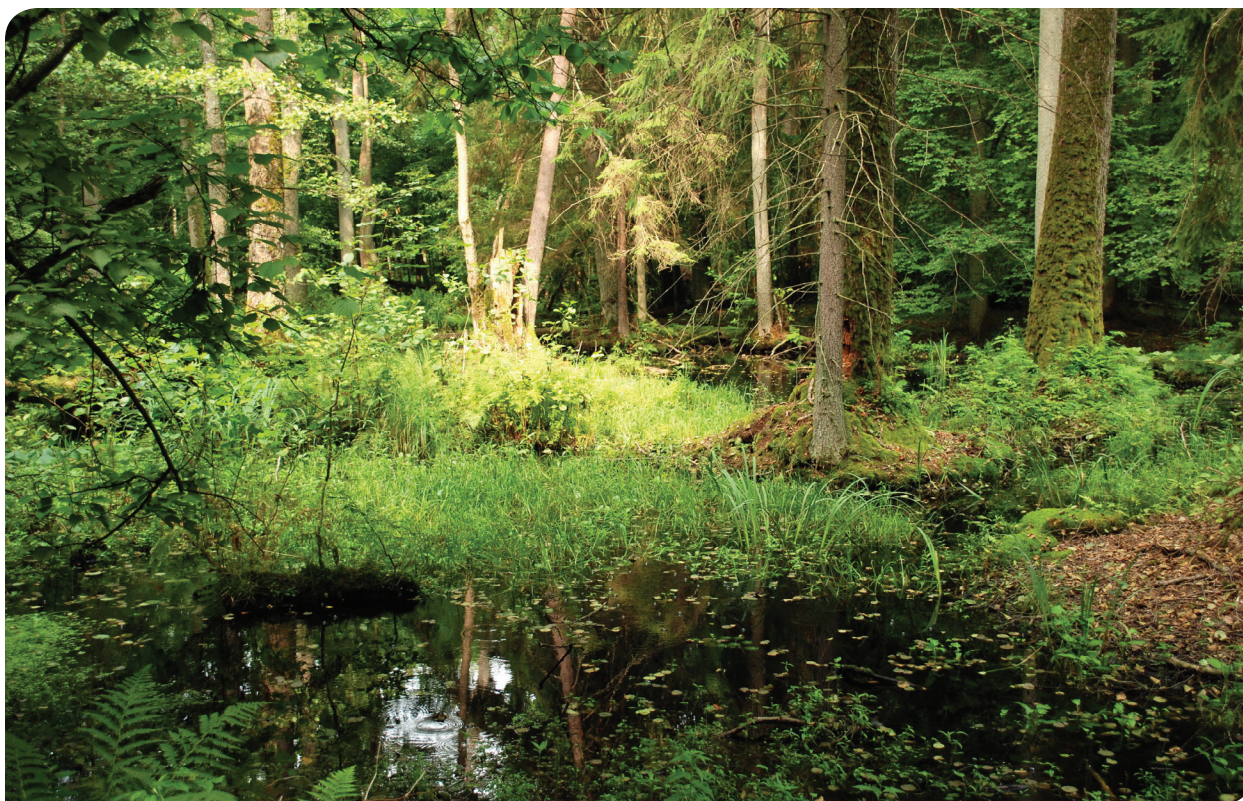
Białowieża Forest in Poland