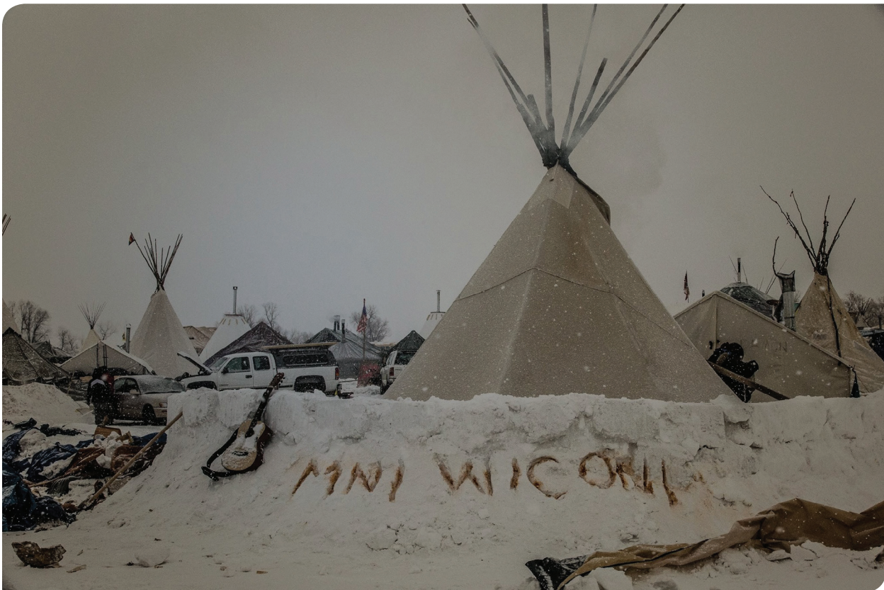
"0 Degrees. We're Still Here" Oceti Sakowin Camp