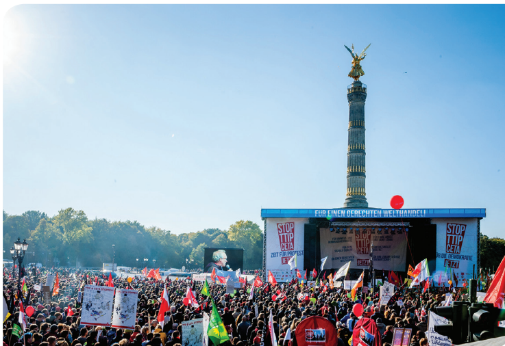
CETA protests in Berlin, 2015

Modern free trade agreements, unlike those of the past, are less about taking down barriers to the trade in goods and more about challenging what are called “non-tariff barriers” - rules and regulations that protect, among other things, water, forests, soil and air. Free Trade Agreements such as CETA, the Canada-EU Comprehensive Economic and Trade Agreement, TPP, the Trans-Pacific Partnership, and NAFTA, the North American Free Trade Agreement, advance the corporate control of natural resources and reduce public control of the environment.